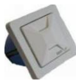
Sensor supplied with 01-140F1072-ASF