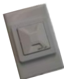
Sensor supplied with 01-140F1072-ANF