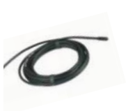
Sensor supplied with 01-140F1072

Sensor option supplied with the above Code Nos.