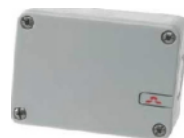
Optional outdoor sensor IP44 01-140F1096